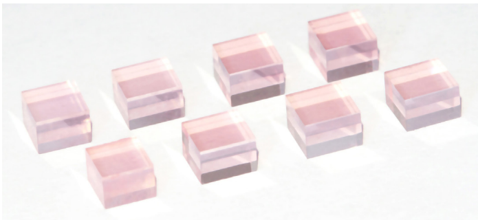
DNV-B1™ CVD diamonds

These properties stem from diamond's unique structure and strong bonds. DNV-B1™ is a baseline material developed to provide a uniform density of NV defects, specifically designed for emerging diamond applications that require ensembles of NV centres.